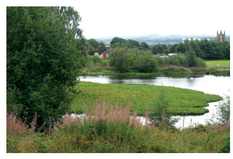
Image 13: It is clear that water is regarded as a natural asset throughout the development, providing an opportunity to benefit people and wildlife.