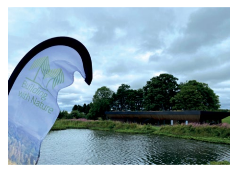
Image 2: Maggie's Centre next to the main hospital building has views out onto green infrastructure from all sides, including onto the loch