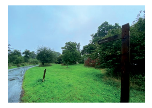
Image 1: Accessible footpaths through the site allow year-round access to the green infrastructure

NHS Forth Valley had to agree to the maintenance of the natural environment as part of the consenting process for the planning application. They provide a fund for on-going management. An established maintenance period of three years was also included in the planning process.