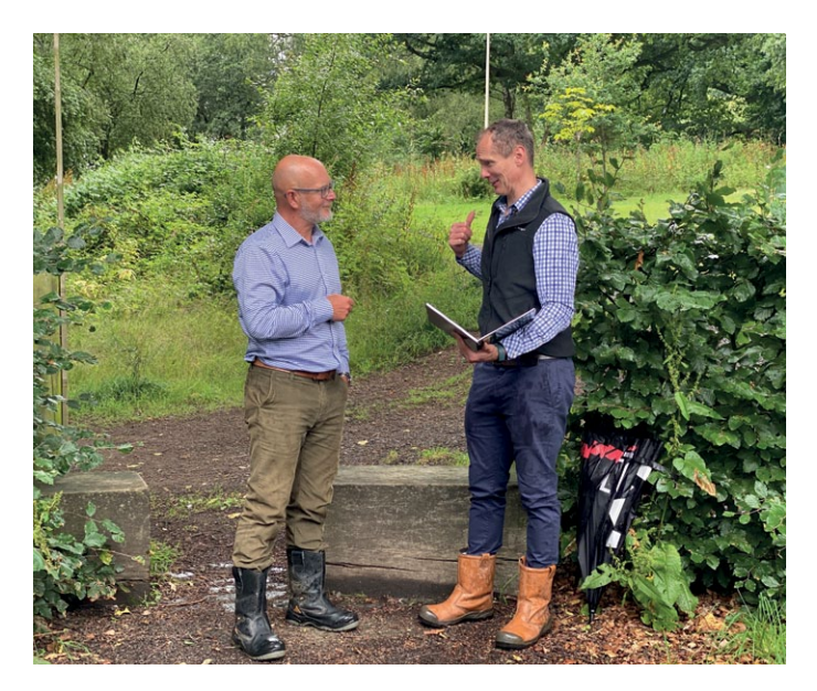
Image 15: Management and maintenance is key to the longevity of the green infrastructure, and an ongoing partnership between NHS Forth Valley and Forestry and Land Scotland ensures a dedicated resource for sensitive management

Furthermore, the estate boundary woodlands were reinstated with a focus on tree species that would help replicate the original planting and landform.