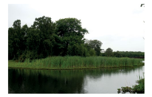
Image 12: The loch integrates new wetland habitat and marginal planting, a result of removing large areas of rhododendron which obscured the loch and prevented access for many years

Additional SuDS features run along the southern perimeter road. There is a large swale feature with detention levees to provide treatment for the water from nearby impermeable surfaces. This swale is planted and maintained with a biodiverse meadow grassland and acts as an ecological corridor along the roads to allow safe species movement.