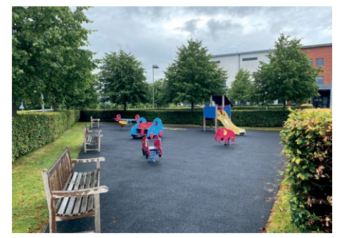
Image 9: Well-equipped family and play area a few metres from the hospital's main entrance