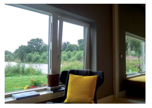
Image 8: Visitors at the Maggie's Centre can enjoy the sights and sounds over the loch