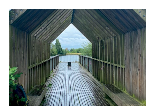
Image 7: The iconic pier which leads out onto the beautiful loch, perfectly framing Larbert Old Church on the horizon

The project demonstrates unequivocally how green infrastructure can align with targeted health outcomes. It highlights the importance of the natural environment for the day-to-day life of an entire community.