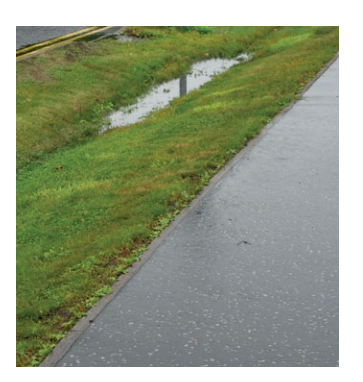
Image 10: Vegetated swales and filter strips throughout car park and grounds

The newly regenerated Loch (0.5ha) provides significant benefits through provision of standing open water and wetland habitat on site. In addition, wetland vegetation supports important habitats and species and helps to maintain water quality.