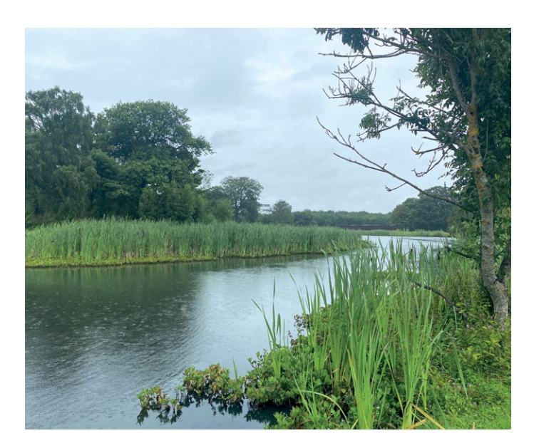
Image 16: Improved marginal species biodiversity as a result of invasive weed removal

Alongside the woodland habitat enhancements, key conservation habitats and species were targeted, such as the roosting spaces provided for brown long-eared bats, and measures for swallows and thrushes.