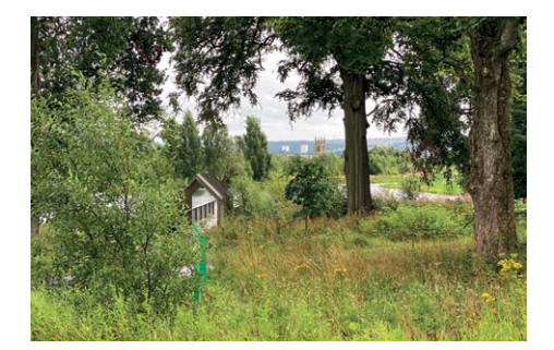
Image 14: The viewing platforms allows an experience of being immersed in the loch and its natural landscape