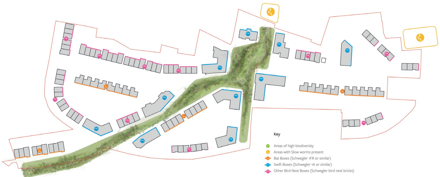
Figure 6: Plan showing wildlife features across the site

There are further ecological networks included such as East-West connections for traveling species through the Green Street, with Northwest linkages through via trees and hedgerows along corresponding pedestrian pathways. Additional street trees provide stepping stones along Poole Park Road and Wilkinson Road.