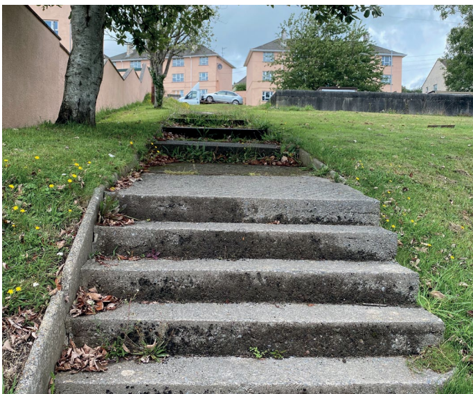
Image 2 & 3: Steep slopes and steps run through the site, limiting general mobility as well as access and enjoyment of green infrastructure