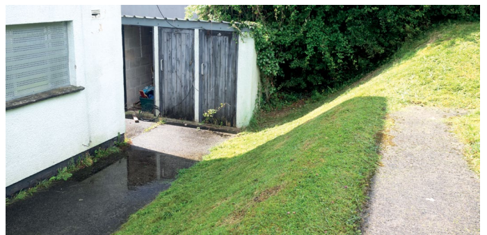
Images 4 & 5: Lack of surface water management means the risk of flooding is high on such a steep development