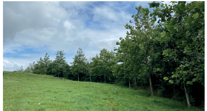
Image 6: The BwN Full Assessment will look for linkages to nearby Blackies Wood

Barne Barton offers a good example of the possible achievements that a community and green infrastructure-centred redevelopment can have. The scheme makes reconnections with the landscape that had been lost over time. BwN have highlighted areas for focus at the Full Assessment stage, including optimising linkages to existing green infrastructure assets including Blackies Wood and the Tamar Estuary. Equally BwN recognise the loss of existing trees on site and will review the planting schedule closely at the next stage of planning.