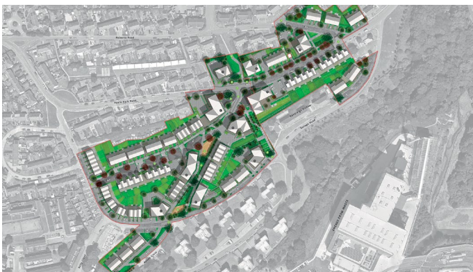
Clifton Emery Design Ltd

This case study demonstrates how this scheme’s green infrastructure meets the BwN Standards, illustrated through the BwN themes of Core, Wellbeing, Water and Wildlife.