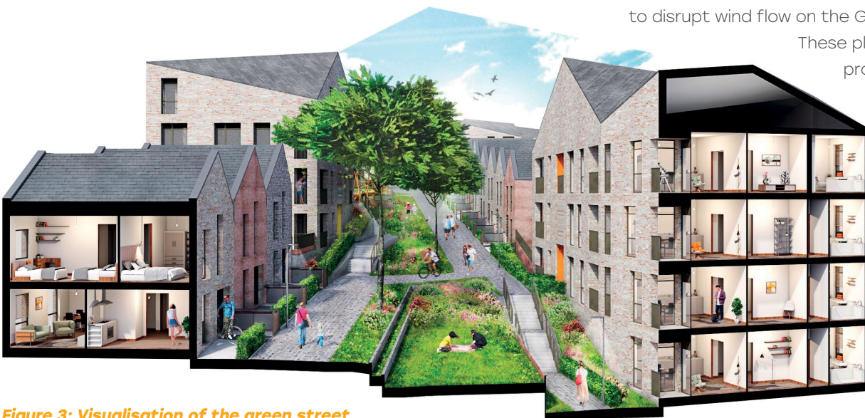
Figure 3: Visualisation of the green street

These plantings also provide carbon sequestration.