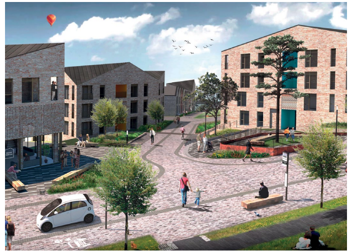
Clifton Emery Design Ltd